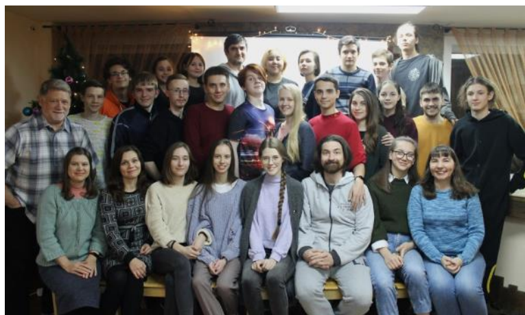
More photos from the winter camp event can be seen at this link: https://vk.com/away.php?utf=1&to=https%3A%2F%2Fphotos.app.goo.gl%2FXvECacZDWaMAuih8

November and December, but the event itself happened the first week of January. We had 33 participants, mostly 14-25 years old, from as far west as Moscow and as far east as Irkutsk. (That's like youth coming from California and Connecticut to attend an event in Kentucky. They literally came by plane, train, bus, and car.)