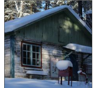
Recent photo by Mason featuring snowy scene.

Greetings from Siberia. I just opened the office window slightly for a few minutes. The fresh -17°C (+1°F) air invigorates. Icy snow is piled on the windowsill, but the chirping of the birds, the brightness of the sun, and the blue of the almost cloudless sky is still enticing. Anybody want to build a ❄️SNOWMAN❄️? No? Okay, then. How about we catch up on the ministry news of the last few months instead? Yes? Great!