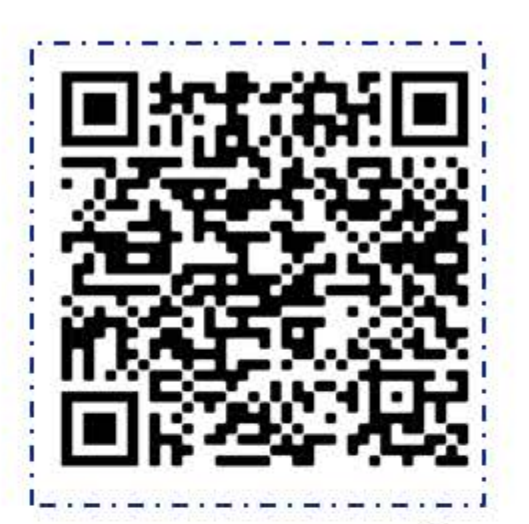
Project Suggestions Here