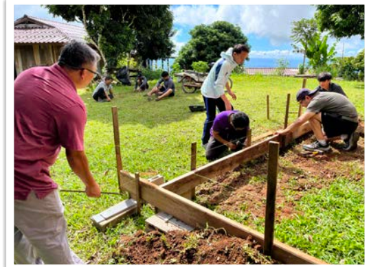
Helping construction of the church building.