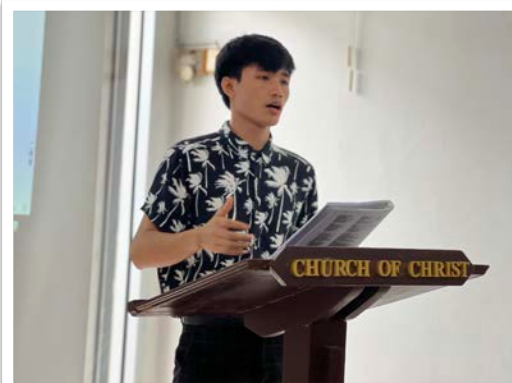
Having chances to serve on Sunday worship