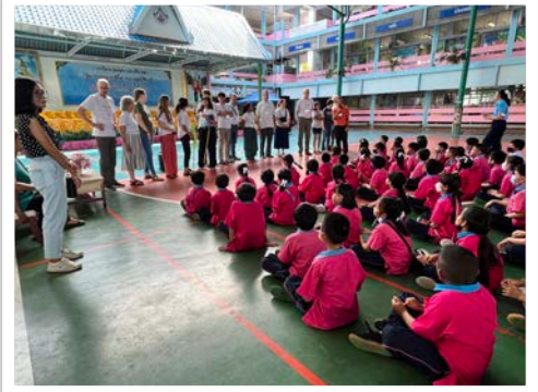
They taught English to the Thai students at school.