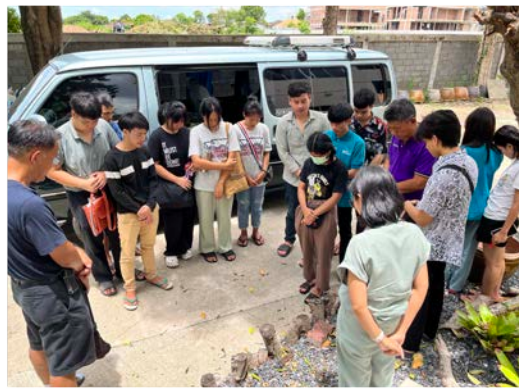
Asking God for blessing before hit the road to churches out of BKK.