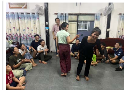
Playing games with local youth to build relationship