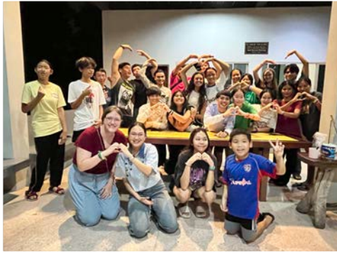
A night before they leaved Thailand, we had a wonderful thank you party.