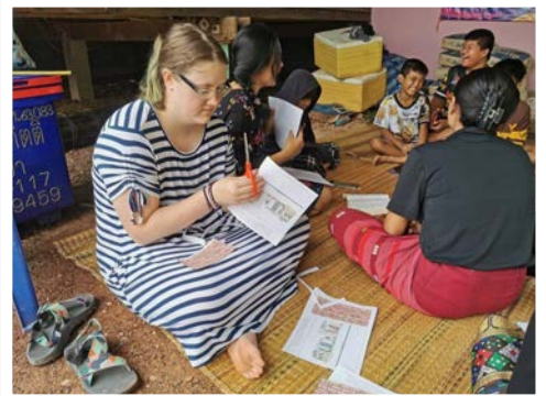
On Sunday morning with the children Bible class.