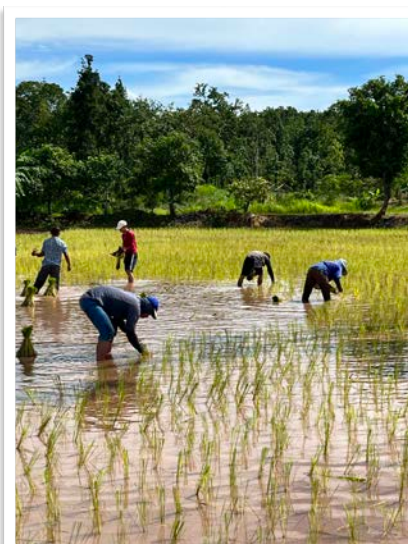
Helping growing rice in the field.