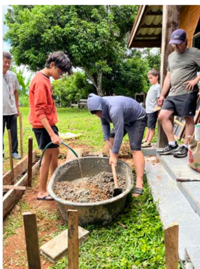
Left: helping building the path in front of the congregation