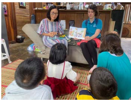
Helping teaching in Bible children classes.