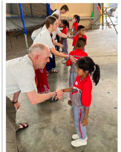
Right: teaching how to greet in English with Thai students.