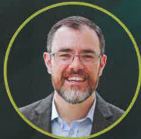
WES MCADAMS CHURCH OF CHRIST ON McDermott Road